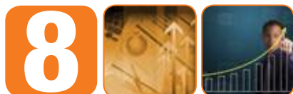
Table 14: Trade (2011) by Chapter (Rs Million) (Continued)