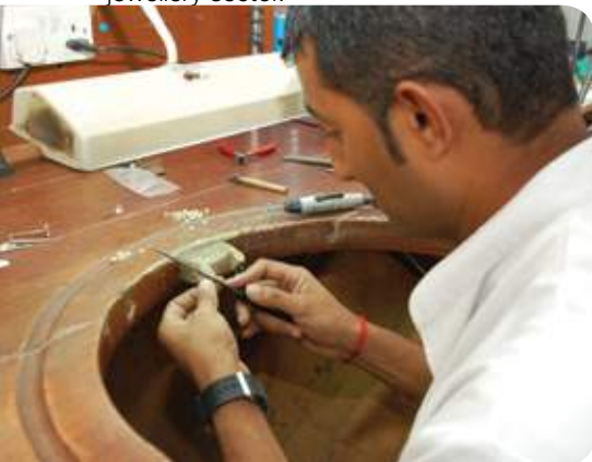
As part of the Jewellery Advisory Council, the MCCI contributes to the strengthening and promotion of the sector.

Consensus is being reached on an Action Plan of the Jewellery Framework and towards the revision of certain regulations on jewellery, especially those relevant with second hand jewellery. A Jewellery Steering Committee has also been set up, of which the MCCI is a Member, to improve the business conditions of the jewellery sector.