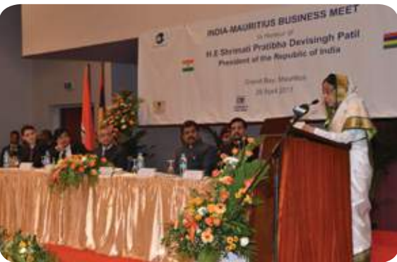
The President of the Republic of India, Hon. Smt Pratibha Devisingh Patil, made a special appeal to members of the business community of both countries to consolidate their relations.

A Business Meet was organized jointly by the Board of investment, the Mauritius Chamber of Commerce and Industry, the Joint Economic Council, the Federation of Indian Chambers of Commerce and Industry and the Confederation of Indian Industry on 28 April 2011 at the International Conference Centre in Grand Baie, in the context of the State visit of President of the Republic of India, the Hon. Smt Pratibha Devisingh Patil.