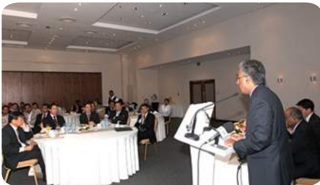
The Minister of Foreign Affairs, Regional Integration and International Trade, Dr. the Hon. Arvin Boolell, sharing his views on the challenges and opportunities in the region at the MCCI Breakfast Meet.