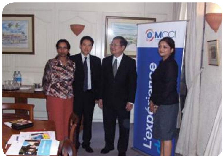
Courtesy visit of the Ambassador of Thailand, H.E Mr. T. Charungyat, to the MCCI