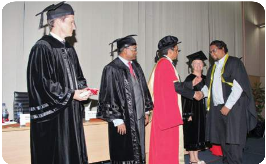
The Graduation ceremony was held in December 2011. Around 97 students were awarded their certificates on that occasion.

Out of the 250 students, 97 students have completed their studies in 2011 and they were awarded their certificates during a graduation ceremony held in December 2011 in the conference hall of the Ebène City Tower 1. The ceremony was held in the presence of the Minister of Tertiary Education, Technology and Scientific Research, the Hon. Dr. R. Jeetah, the representative of the French Embassy and the Deputy Director of the IAE of the University of Poitiers.