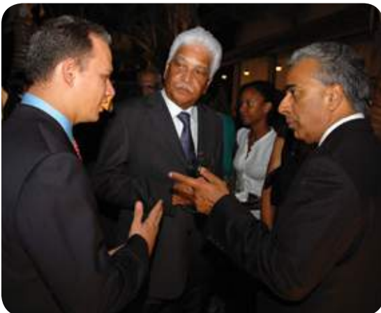
From left to right: Mr. Jean-Paul Adam, Minister of Foreign Affairs of Seychelles, Mr. Jean-Claude de l'Estrac, Secretary General Designate of the Indian Ocean Commission and Dr. the Hon. Arvin Boolell, Minister of Foreign Affairs, Regional Integration and International Trade.