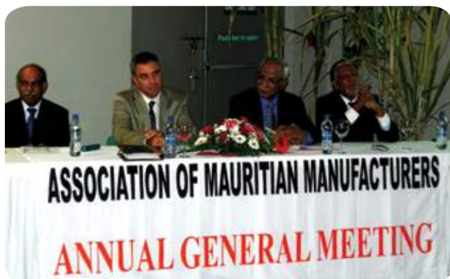
The Annual General Meeting of AMM was held on 26th March 2012. The MCCI and AMM have been working very closely to promote the manufacturing sector.

One of the most important objectives of the MCCI is to enhance market access to existing export destinations and to open new markets for our products. In addition to the negotiations discussed earlier, the MCCI has been active in tackling the Non-Tariff Barriers which are faced by our exporters.