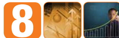
Table 3 : Gross Domestic Product - sectoral real growth rates (% over previous years)