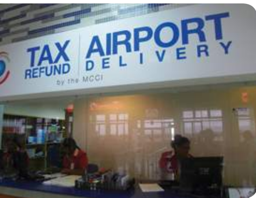
The MCCI Tax Refund Counter at the SSR International Airport.

The ATA carnet, which the MCCI issues since 1984, facilitates the duty-free temporary imports of certain categories of goods in a number of countries. The ATA carnet covers namely professional equipment, commercial samples, and goods for presentation or use at exhibitions, trade fairs, shows and the like.