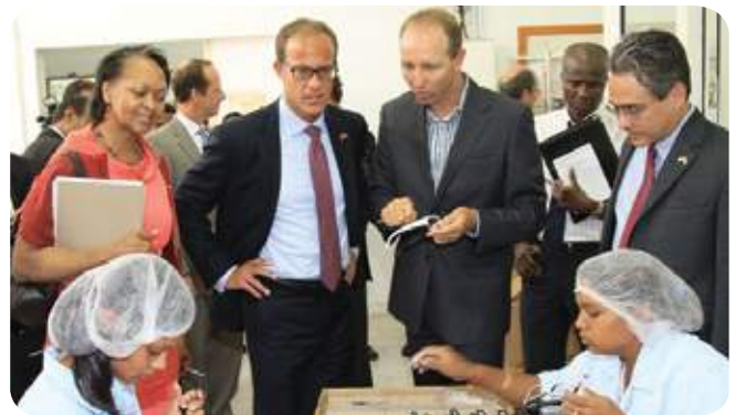
A factory visit was organised by the MCCI at Plastinax Ltd.